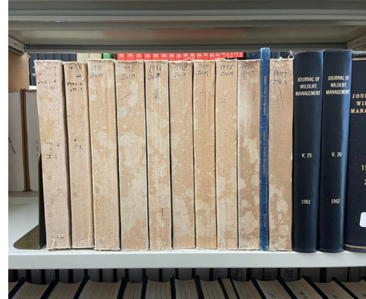
New (old) journals in all their glory.

Online access to this journal can be found using QuickSearch's Publication Finder tool here .