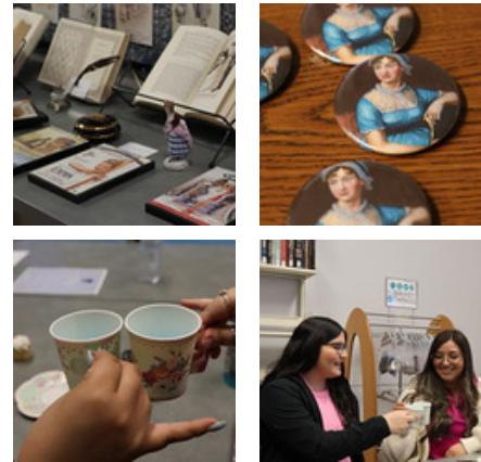
Jane Austen at 250 Opening