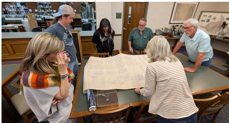
Organizers, volunteers, and participants in the first Archives Community Roadshow gather to check out a potential donation.