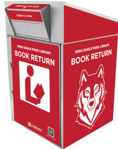
Mockup of our new book drop!

In October, we launched our seasonal QR code recommendation lists. Each month, we'll share themed reading lists, including seasonal picks and staff recommendations from our Eagle Pass and Alpine collections. With Direct Mail, students, staff, and faculty based outside of Alpine can have titles shipped directly to their homes!