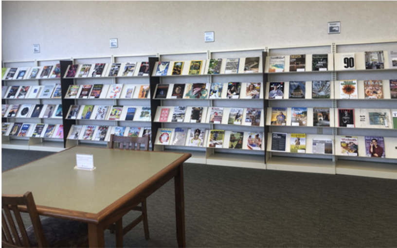
Beautiful Level 1 periodicals display @ BWML; photo and work courtesy Taylor Moore.