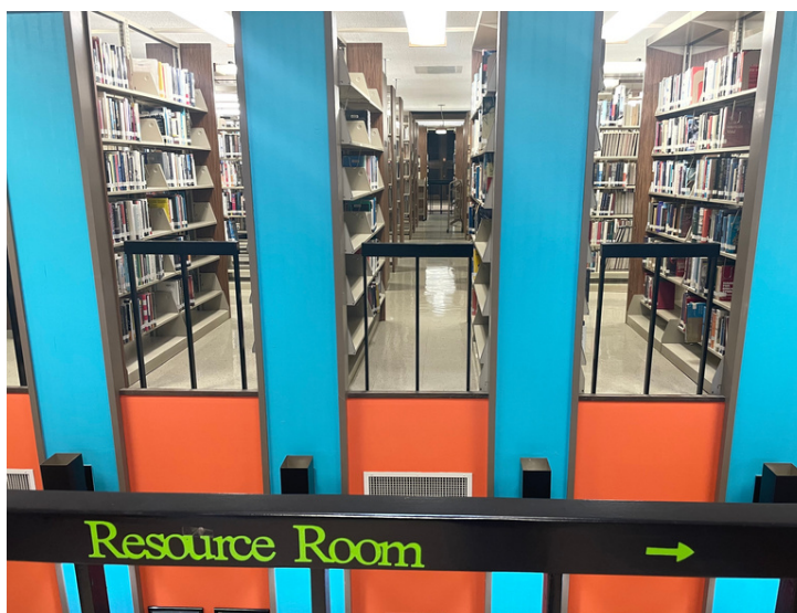
Uvalde's Will C. Miller Library at SRSU-RGC